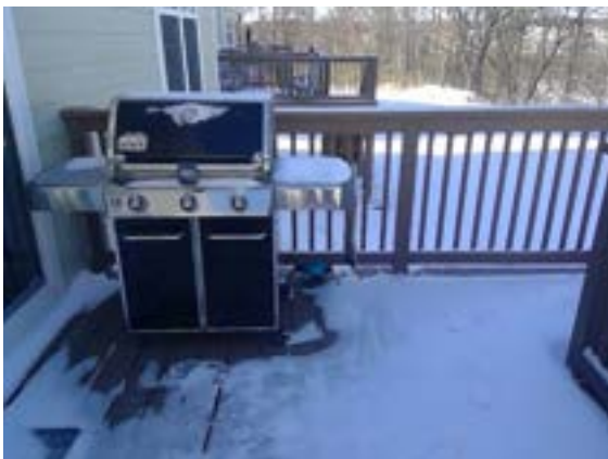
Decks / Balcony: