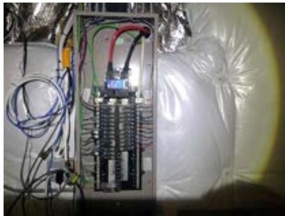
Electrical Random Sample: