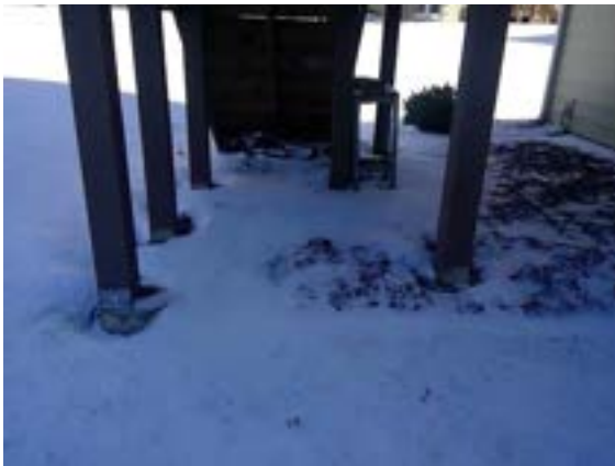
Decks / Balcony:

Limited inspection of deck due to snow cover. Visible areas appeared acceptable, with general deterioration and weather damage. Recommend further evaluation when snow has melted. Regular wood treatment maintenance should be done to preserve remaining life expectancy of construction materials.