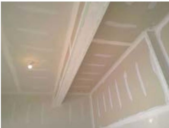
Under Floor Framing & Support:

Where visible, framing and support was in good condition.