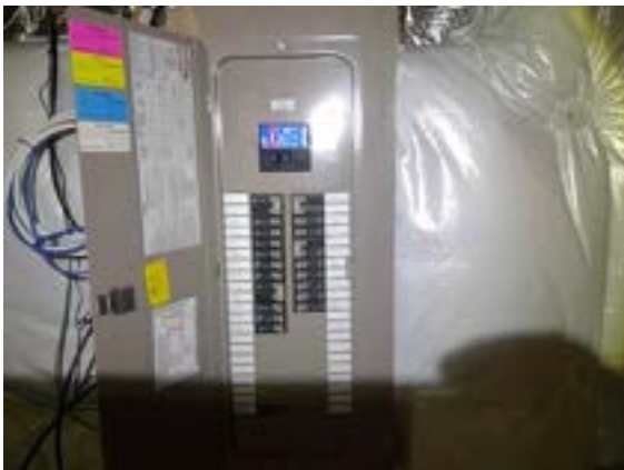
Electrical Random Sample:

*Smoke Detectors / GFCI's checked with test button only. Monthly Test Recommended.