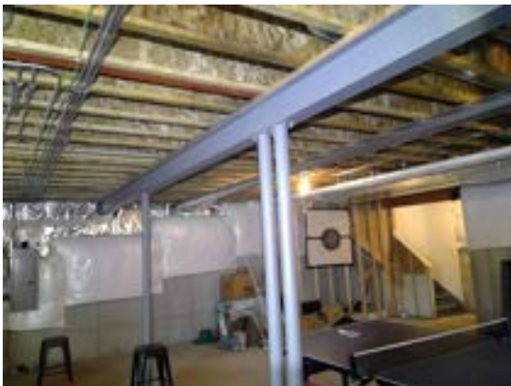
Under Floor Framing & Support: