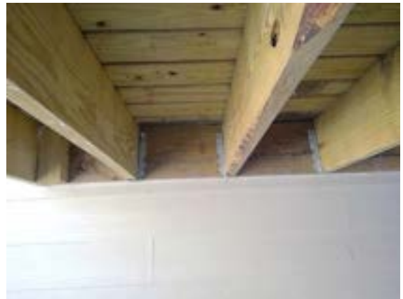
Decks / Balcony: