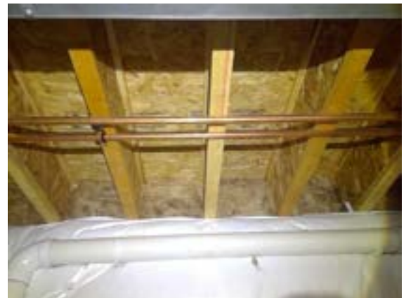
Under Floor Framing & Support: