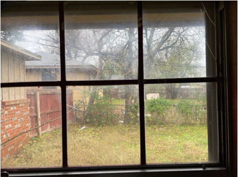
Rear Family Room