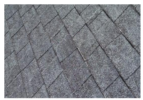
Medium Wear, 5-15 years Mild to moderate granular loss Some cupping or curling