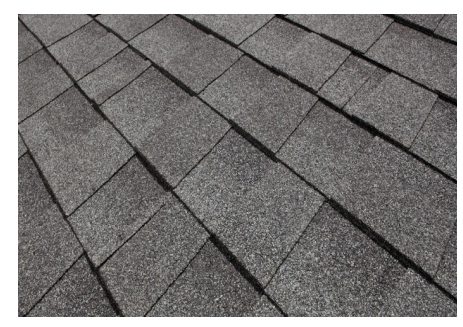
New, 0-5 years Little to no granular loss No cupping or curling Straight edges