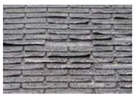
Heavy Wear, 15+ years Excessive granular loss Excessive cupping or curling Deformed edges