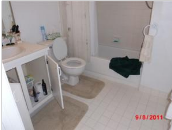
Suite #1 bath