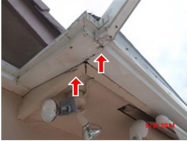
1.3 Picture 1 wood rot leaking gutter

1.3 The both corners of the rear porch where the gutter and screen is attached to is rotted out from leaking gutters recommend repairs.