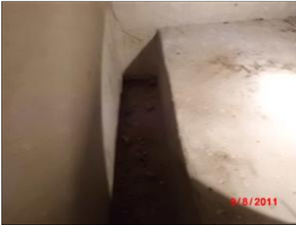
7.0 Picture 1 Dirty return vent