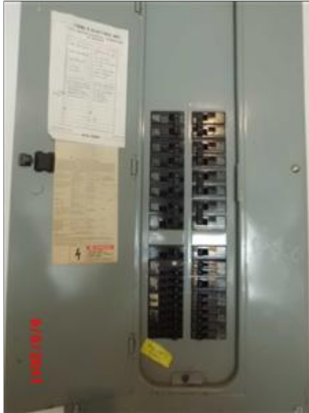
Service panel with cover