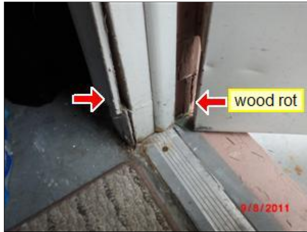
3.3 Picture 1 rotted door frame

3.3 Wood rot to the side door bottom of track and to door frame both inside and out.