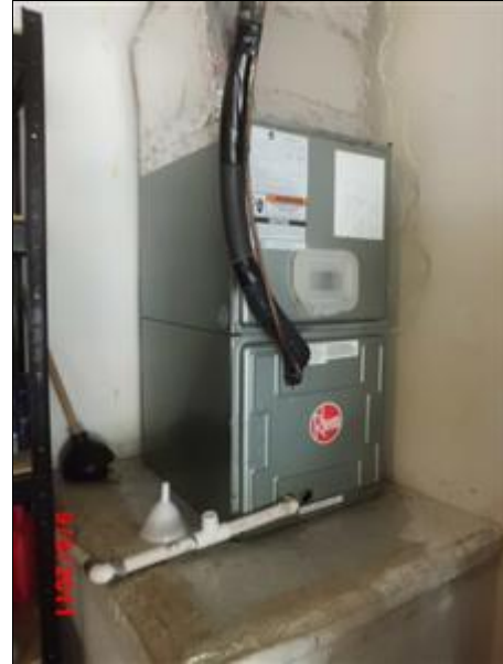
Air handler garage