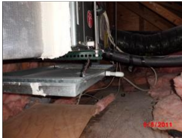
Air handler #2 attic