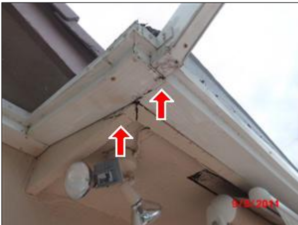
1.3 Picture 1 wood rot leaking gutter

The both corners of the rear porch where the gutter and screen is attached to is rotted out from leaking gutters recommend repairs.