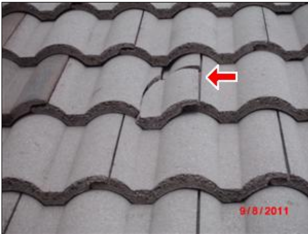
2.0 Picture 1 broken tiles front

The roof at time of inspection is free from leaks however repairs are needed to maintain the roof. The left side approaching the front stoop one end tile loosely hanging. There are approximately 12 to 15 broken or crack tiles in the field. Recommend repairs by qualified roofer.