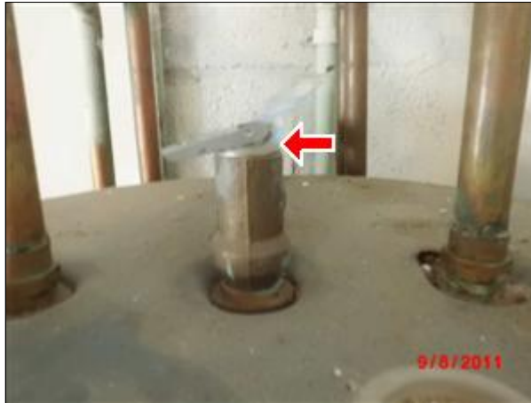
5.3 Picture 1 PSI valve

5.3 The water heater is rated marginal due to its age beyond its design life and will likely need replacement soon. The PSI valve is stuck and does not operate recommend repairs.