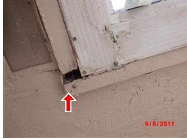
1.3 Picture 2 wood rot rear

1.5 The side door rusted and rotted out frame both inside and out recommend repairs.