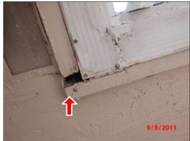
1.3 Picture 2 wood rot rear