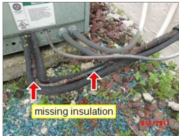
7.3 Picture 1 insulation damage

Both condensers need to be service and clean and the expose copper pipes need to be insulated for proper cooling.