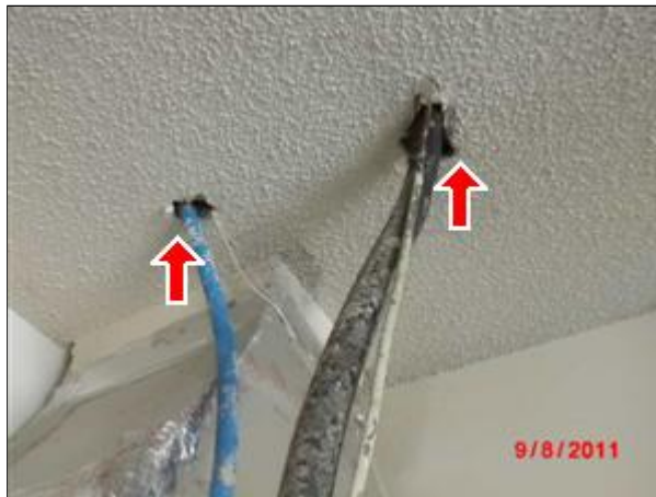
3.0 Picture 1 sela around pipes

There are old water stains observed inside the attic which is from previous old roof leak. Seal all opening to ceiling and attic for fire rating.