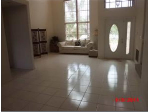
Living / Dining room