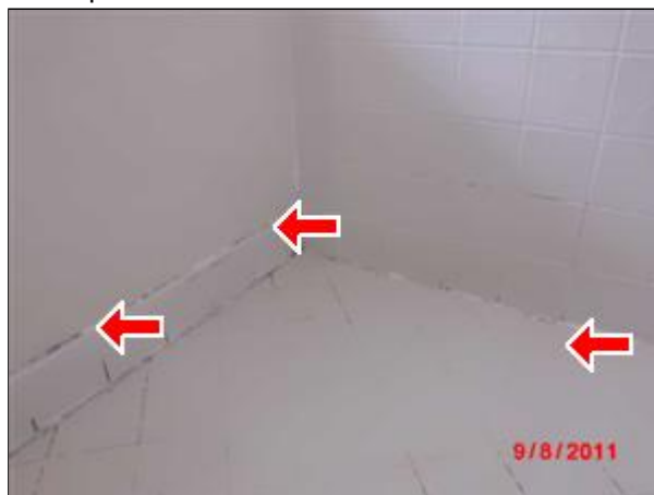
10.8 Picture 1 shower stall

Recommend clean grout lines and re-grout shower stall no loose tiles or moisture intrusion to the tiles noted and repairs are for preventive means. The present condition is from use and lack of maintenance.