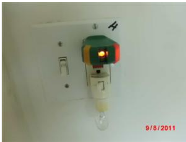
10.4 Picture 1 hot/neutral reverse

10.4 The GFCI outlet is hot neutral reverse recommend correction.