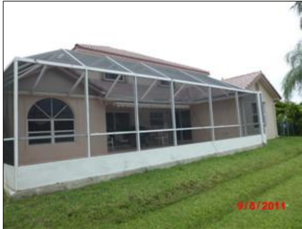
Rear of home