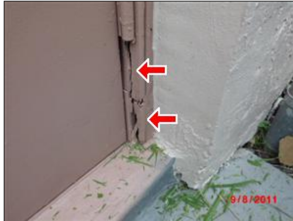
1.5 Picture 1 side door rotted

1.5 The side door rusted and rotted out frame both inside and out recommend repairs.