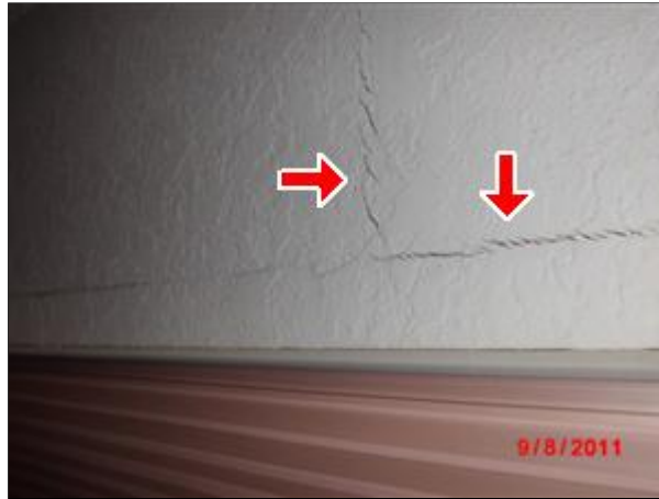
14.1 Picture 1 corner flashing lifting