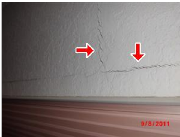
14.1 Picture 1 corner flashing lifting

14.1 The corner flashing above the window is separating from the wall and hairline crack above window no leaks and considered a minor repair when room is to be re-painted.