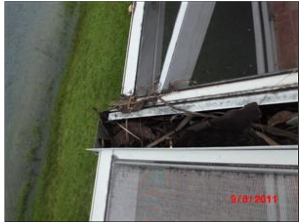
2.4 Picture 2 clogged gutter