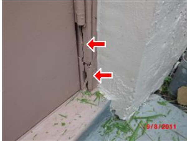
1.5 Picture 1 side door rotted

The side door rusted and rotted out frame both inside and out recommend repairs.