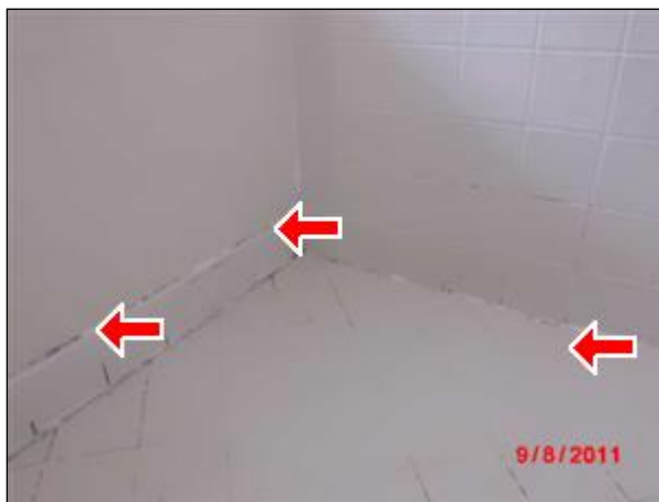
10.8 Picture 1 shower stall

10.8 Recommend clean grout lines and re-grout shower stall no loose tiles or moisture intrusion to the tiles noted and repairs are for preventive means. The present condition is from use and lack of maintenance.