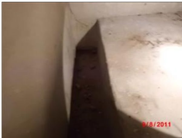
7.0 Picture 1 Dirty return vent

REcommend service to the unit that is located inside the attic above the master bedroom.