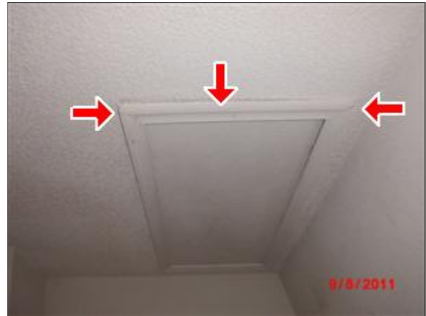
12.0 Picture 2 seal attic access