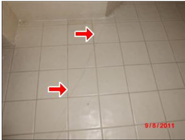
10.2 Picture 1 crack tiles

10.2 There are 6 to 8 tiles with hair line cracks from age and settlement over time no present concern.