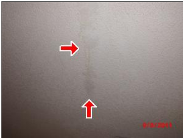
12.0 Picture 1 a/c leak from attic

12.0 There are old water stains to the ceiling two places which was caused by the air handler that is located inside the attic. The air handler leaked at one time and the condensate line to the condenser was sweating prior to insulation replacement and dripped onto the ceiling by the air vent/register. Re-paint the ceiling.