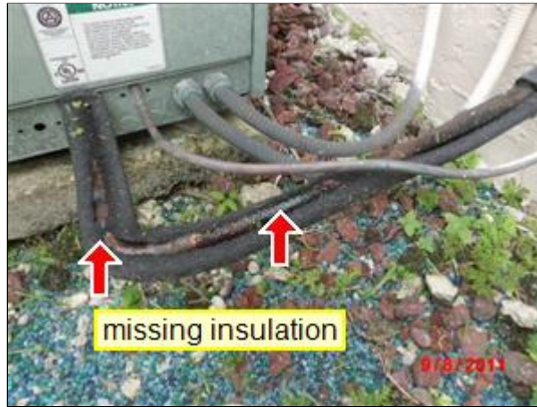
7.3 Picture 1 insulation damage

7.3 Both condensers need to be service and clean and the expose copper pipes need to be insulated for proper cooling.