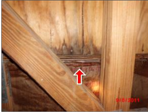
2.5 Picture 1 old water stain attic garage

2.5 Old water stain observed from the attic access inside the garage to the area that was once leaking that caused the water stains to the ceiling no present leaks observed.