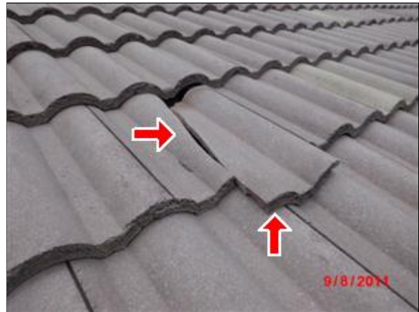
2.0 Picture 2 broken tiles