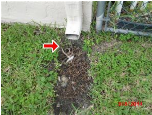
2.4 Picture 1 missing splash stone

2.4 The gutters are missing splash stones. The gutter top left side facing home is loose and could fall off at any time recommend repairs. The gutters need to be cleaned and seal around the joints.